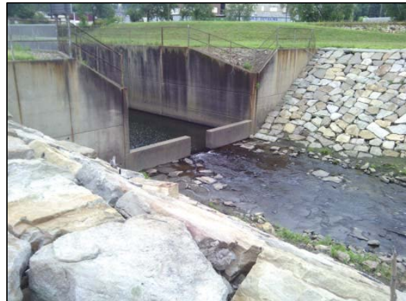
Channelized streams in Scranton: Clover Hill Creek (top), East Mountain Run (center), and Stafford Meadow Brook (bottom)