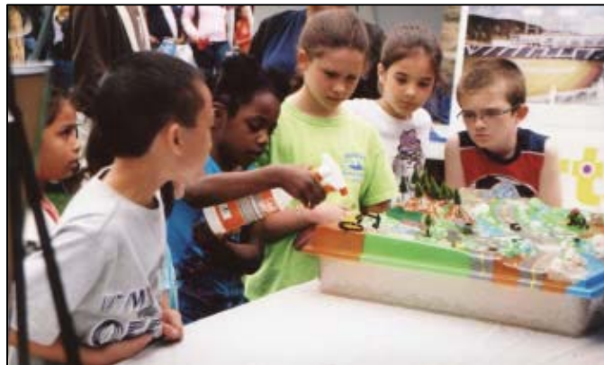
An environmental education program at the Scranton Iron Furnaces

For more information, please visit the MOST Knowledge Center .