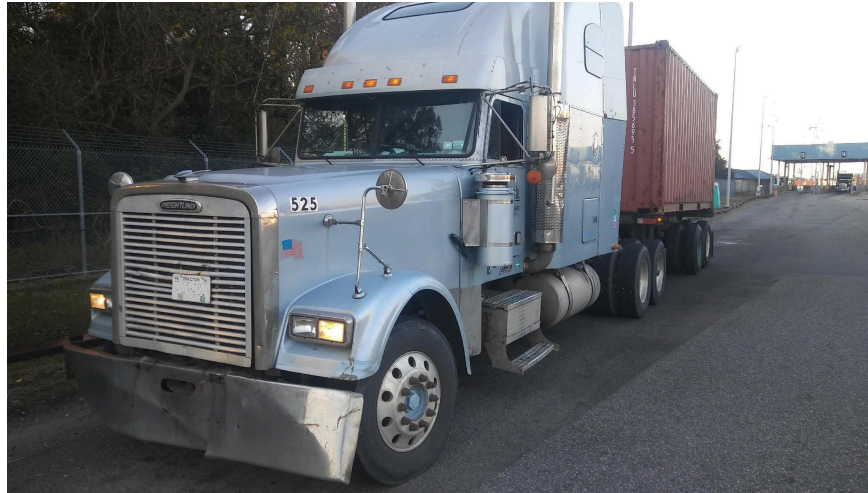
Truck outside the port with gate in background

example below). Ensure that your photos at the Port clearly show the truck and tag number. Add an additional photo zoomed out with the truck and license plate showing.