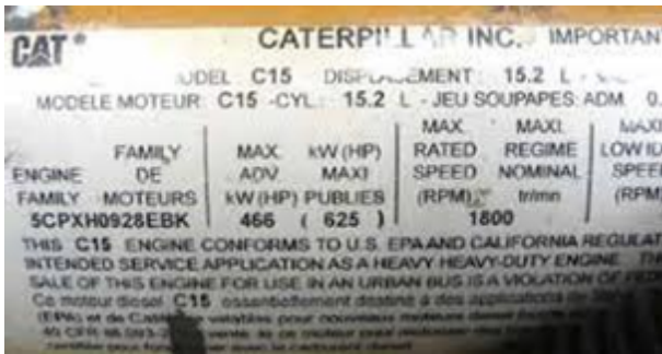
Caterpillar Engine Example