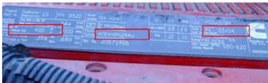
Cummins Engine Example