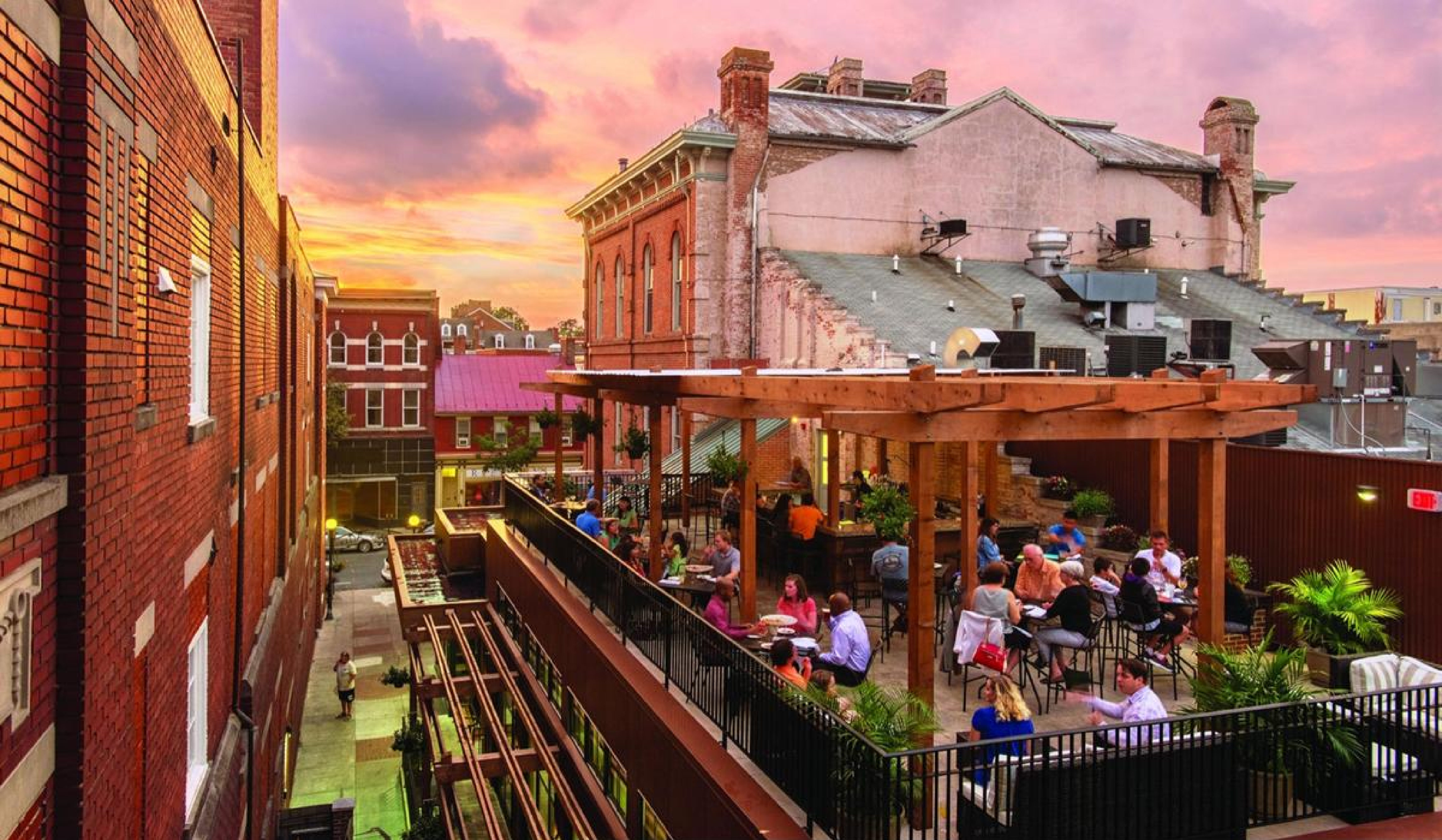
Carroll Creek Square