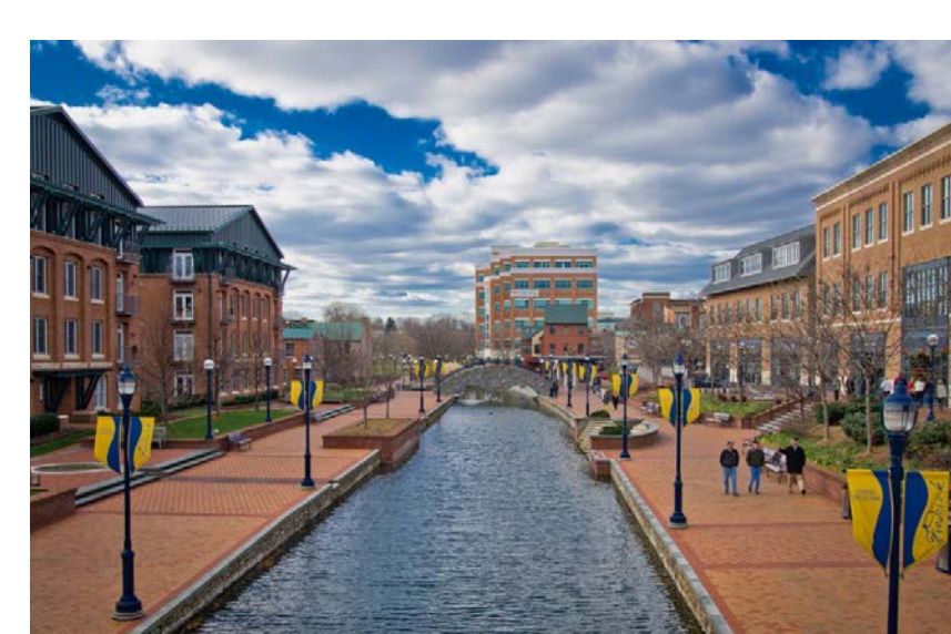
Preserve the Past