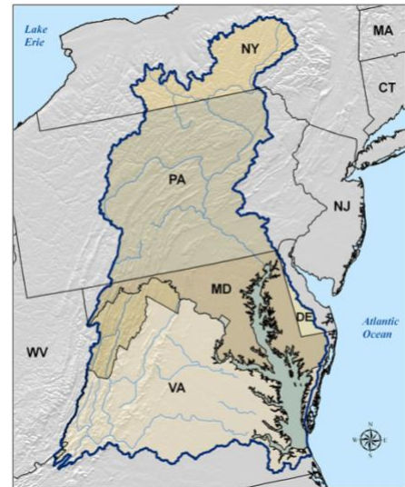
Figure 1. New York’s location within the Chesapeake Bay watershed.

To restore the health of the Chesapeake Bay and to preserve water quality in New York’s local streams and rivers, the state has joined the five other Bay states and the District of Columbia in adopting rigorous pollution reduction targets. These goals are spelled out in the US EPA’s Chesapeake Bay 2010 TMDL, which specifies levels of nutrient and sediment pollution reductions that must be achieved in each Bay jurisdiction by 2025 in order to meet water quality standards for dissolved oxygen, water clarity, underwater Bay grasses, and chlorophyll a. 6 Table 1 shows TMDL final targets for New York and for the watershed as a whole.