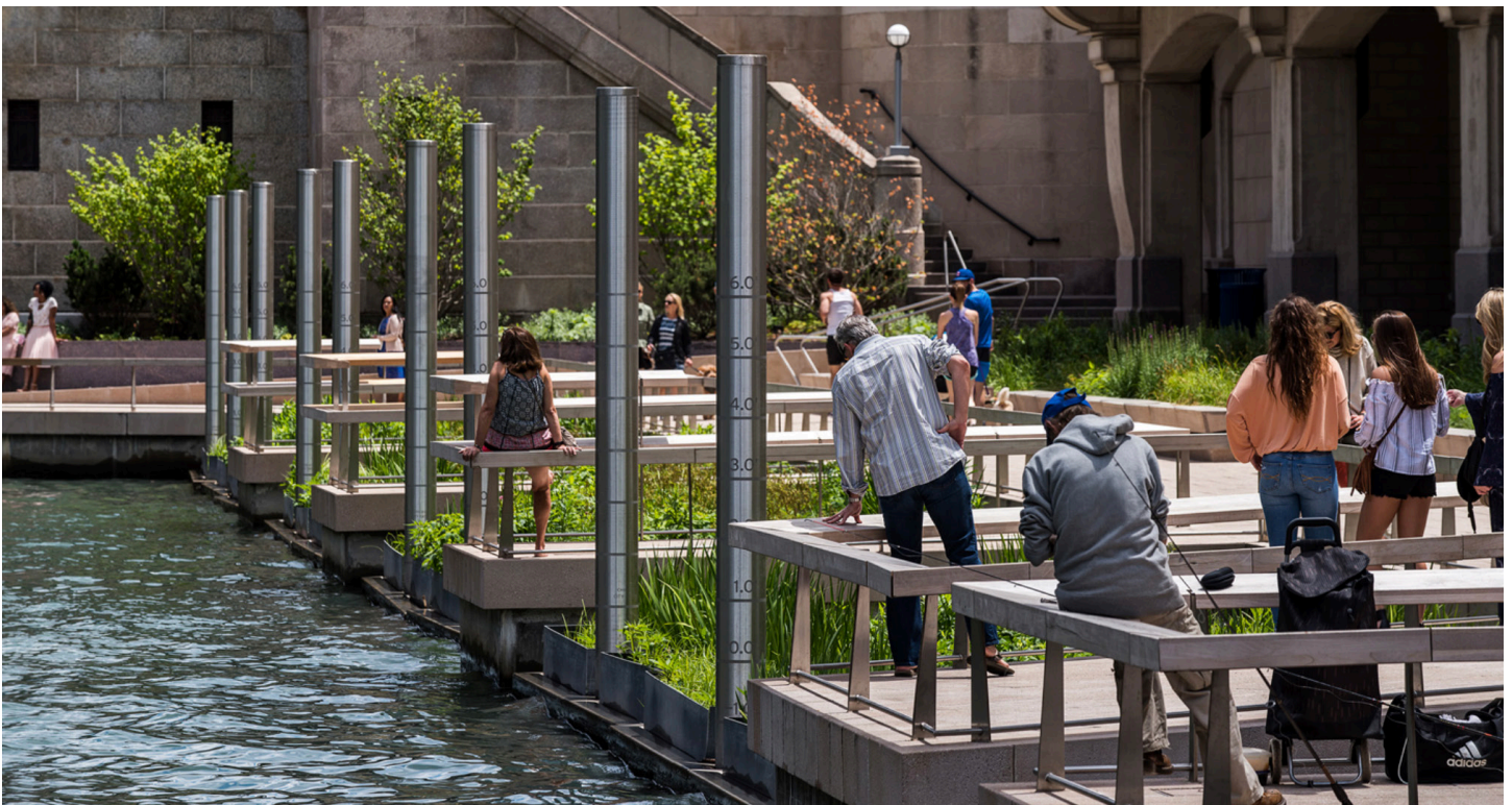
ASLA 2018 Professional General Design Honor Award, Chicago Riverwalk | State Street to Franklin Street. Sasaki and Ross Barney Architects