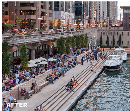
(Left) ASLA 2018 Professional General Design Honor Award. Chicago Riverwalk | State Street to Franklin Street. Sasaki and Ross Barney Architects / Sasaki (Right) ASLA 2018 Professional General Design Honor Award. Chicago Riverwalk | State Street to Franklin Street. and Ross Barney Architects

The Riverwalk, Chicago, Illinois. For years, the riverwalk was uninviting, with narrow paths, limited vendors, and no direct engagement with the Chicago River. Landscape architects with reimagined the riverbank as a destination, with flood-resilient pedestrian promenades that connect to the water and increase space for amenities. The design has revitalized recreation and economic activity along the river. The Riverwalk doubled the number of vendors, increased profits by 164%, and generated nearly $50 million in revenue in 2018.